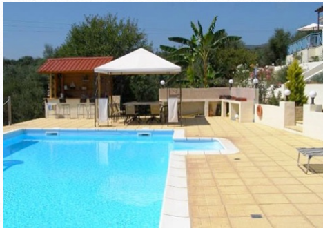
Fig Leaf Villas

Three well equipped villas set in an acre of terraced gardens. There's a large communal swimming pool, a sun terrace and an outdoor shower. On special nights the hosts provide Greek and Indian dinners. Fig Leaf is close to lots of interesting spots to visit including several textile beaches, nature reserves and ancient Greek sites.